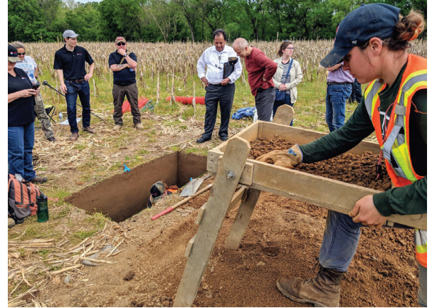
An archaeological technician sifts through excavated soil at a cultural survey and archaeological testing site along the proposed MVP Southgate project. Members of the North Carolina Office of State Archaeology, the North Carolina Commission of Indian Affairs and the U.S. Army Corps of Engineers visited the site to witness the surveying activities.

For more than a year, our team has been working with experts in the field to identify environmentally and culturally sensitive areas along the project's proposed 74 mile route. We are dedicated to building this project in the most responsible manner, and teams of archaeologists, biologists and engineers have worked diligently to avoid those sensitive areas, mitigate any impacts and develop the best possible route in order to provide the additional supply of natural gas that North Carolinians need.