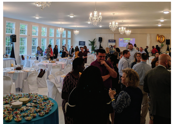
Rockingham County Education Foundation's 10th annual fundraiser benefit was supported through ticket sales, donations and sponsorships, with proceeds directly supporting programs to increase educational opportunities for county residents.

We intend to continue working with local and state public safety agencies and emergency responders to discuss the safe and responsible construction and operation of the proposed pipeline.